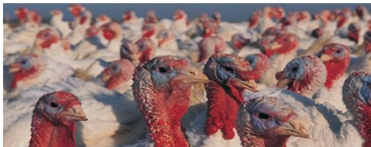
Information About Avian Influenza (bird flu) in the United States

While we are continuing to deal with this historic outbreak of Avian Flu we will work to provide all the resources and information we can to protect our domestic flocks and our agriculture industry generally.